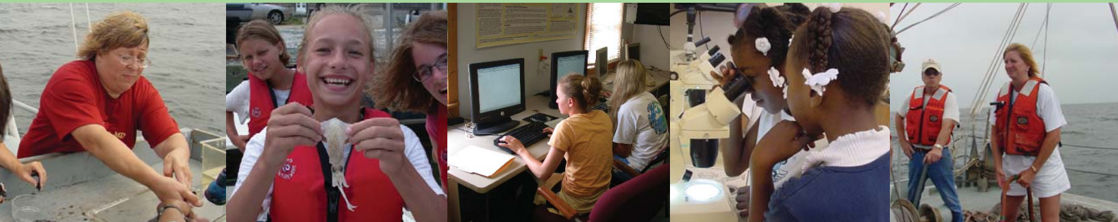
ChART Your Way to Bay Education

More information on the application process and other programs is available at http://chesapeakebay.noaa.gov .